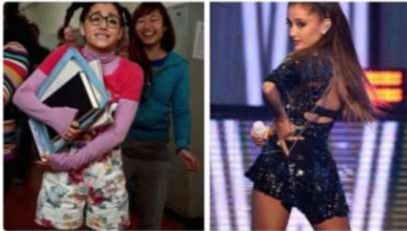
Junior Year vs Senior Year

Welcome to your first official term as a senior high school student! The next two years (or, technically, year and three-quarters) of your high school experience are all about preparing you with the practical and conceptual skills that you will need to finish Year 12 and move on to university or the workplace.